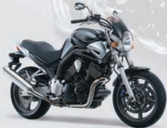
MIDNIGHT BLACK (BL2)