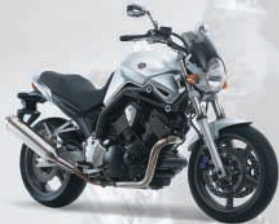
METALLIC SILVER (SM1)