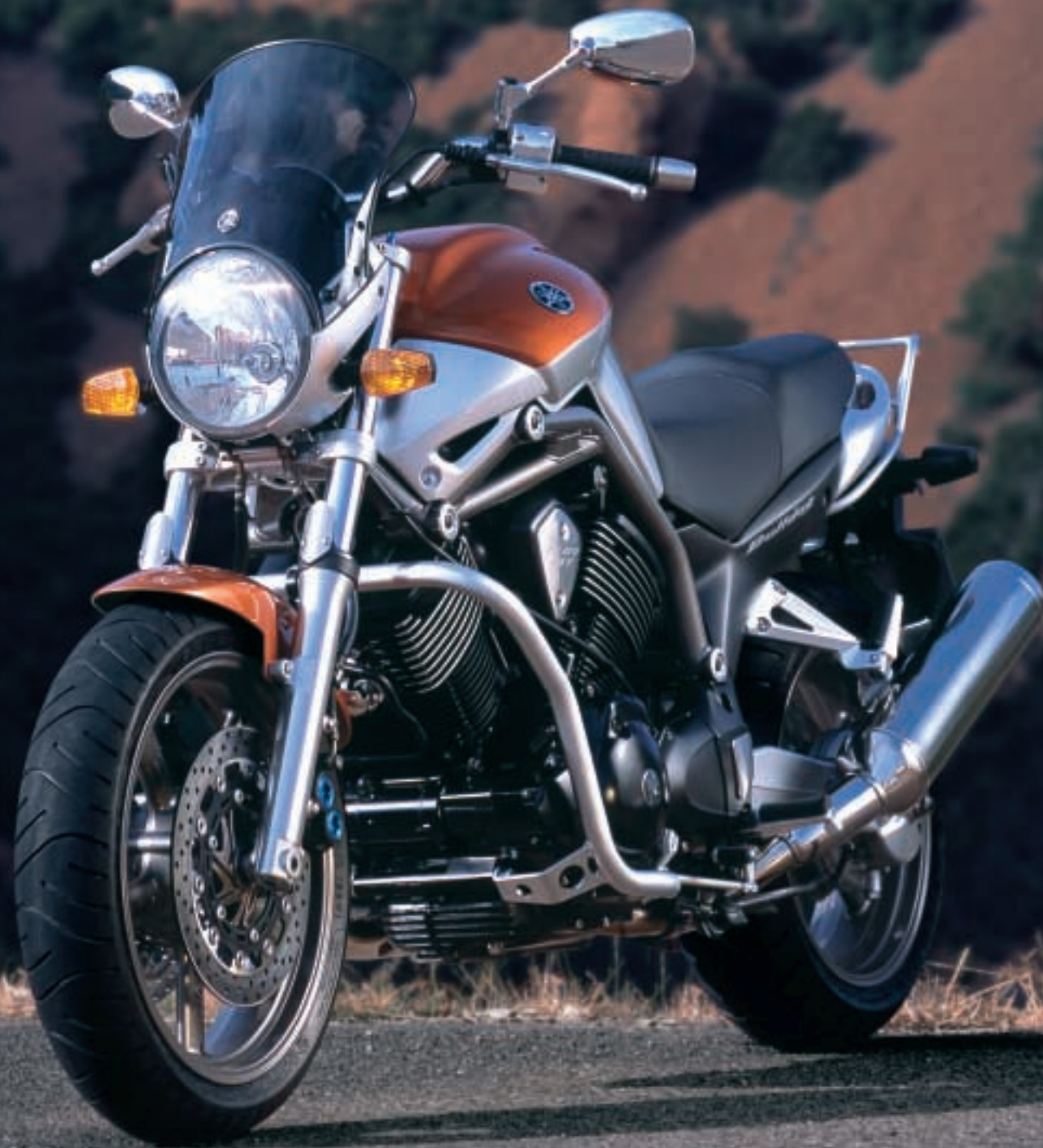
BT1100 equipped with accessories